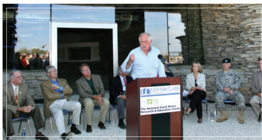
ILLINOIS GOVERNOR PAT QUINN PRESENTED THE NGRREC AND LEWIS AND CLARK COMMUNITY COLLEGE WITH $16.5 MILLION FOR THE CONFLUENCE FIELD STATION.

The building will be a model of green construction including a vegetative roof, innovative waste water technology and on-site wind and hydro power.