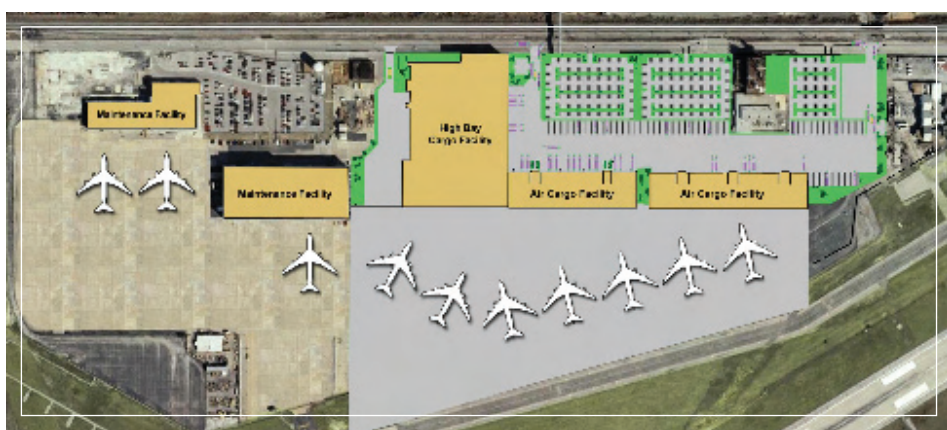
RENDERING OF AIR CARGO FACILITIES PLANNED AT LAMBERT-ST. LOUIS INTERNATIONAL AIRPORT

76-ACRE DEVELOPMENT WILL HAVE PRIME AIRFIELD ACCESS