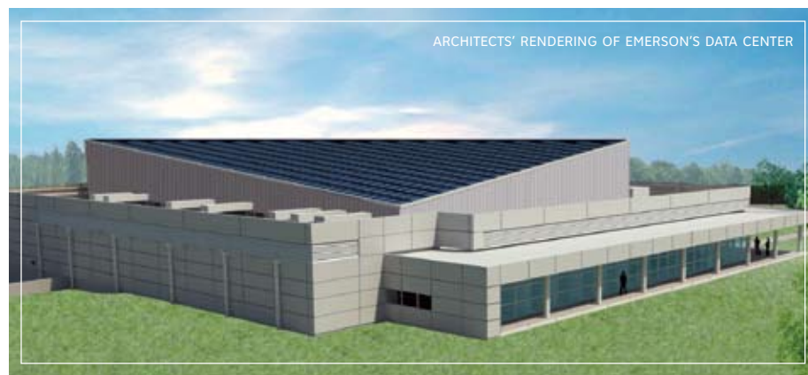
ARCHITECTS’ RENDERING OF EMERSON’S DATA CENTER

Utilizing additional eco-friendly features such as natural daylight and a reduced footprint, the new facility also will use 17.5 percent less energy per year and qualifies for LEED Silver certification. It also will feature