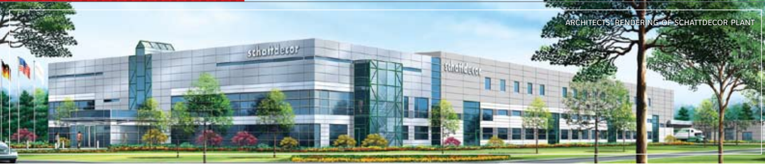
ARCHITECT'S RENDERING OF SCHATTEDECOR PLANT