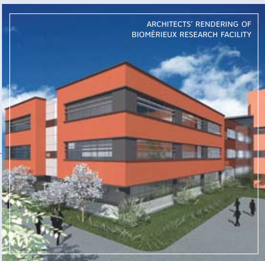
ARCHITECT'S RENDERING OF BIOMÉRIEUX RESEARCH FACILITY